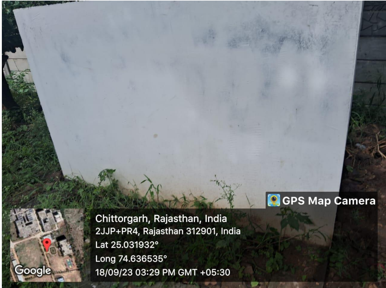
Hazardous Chemical waste management