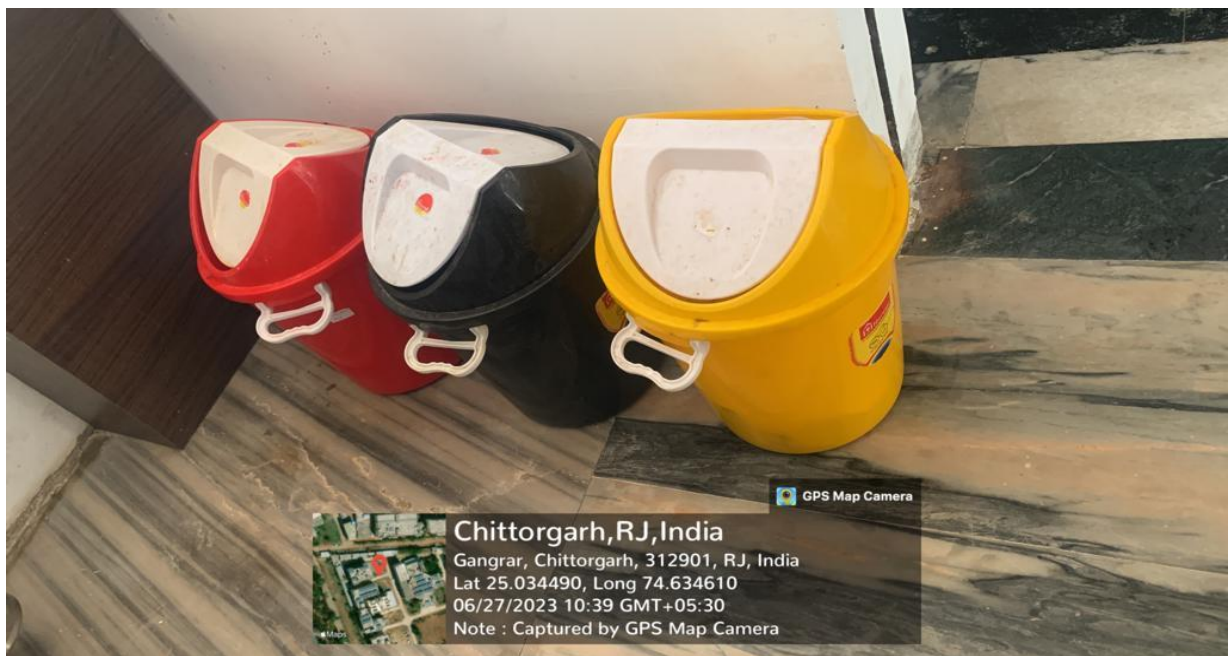
Biodegradable and Non Biodegradable waste management